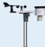
Simple weather station