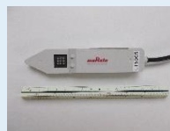
Soil moisture sensor